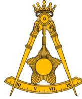
Lodge of Perfection